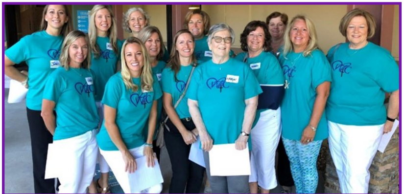
Pictured above some members from the W4C leadership team and volunteers from the Kick-off Brunch.

Blessed is she who has believed that the Lord would fulfill His promises to her! Luke 1:45