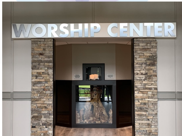
Worship Center Entrance

Please continue to check the Crosswater website and/or Facebook page for updates regarding reopening.